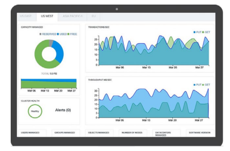
Cloudian Management Console One window for configuring, managing, and monitoring.

The highly active S3 developer community generates lots of innovative apps in categories including: enterprise secure file sharing; backup, data retention & archiving; NFS/CIFS gateways; and desktop file storage & backup; Cloudian uniquely supports them all.