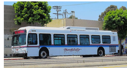
MBL operates 72 buses covering 26 square miles and serving over 8 million passengers per year.

"Cloudian's object storage combined the scalability, cost efficiency, Amazon S3 interoperability, and rich metadata tagging we needed to make this project possible."